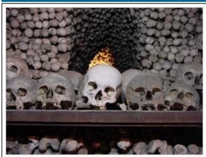
Kutna Hora Tours from Prague

Enjoy a sightseeing day tour to Kutná Hora in Prague, Czech Republic.