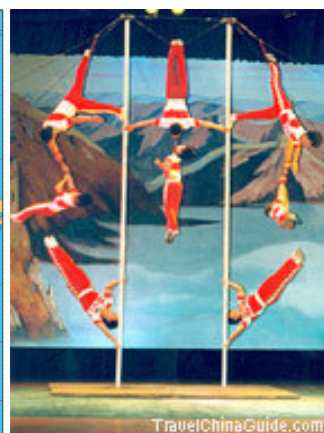
Chinese Acrobatics Show