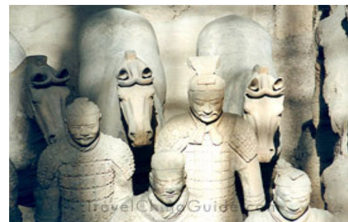
Terra Cotta Warriors